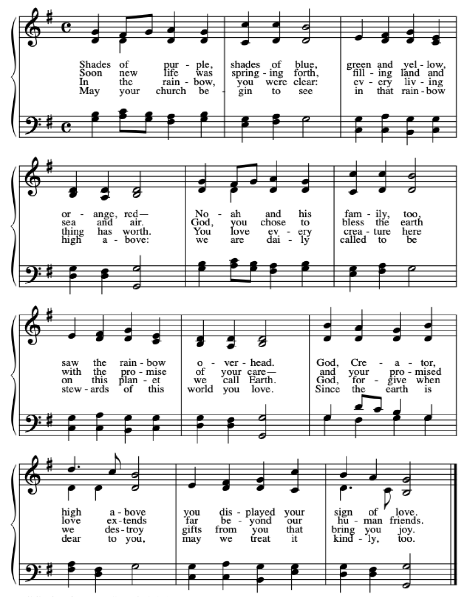
*Call to Confession