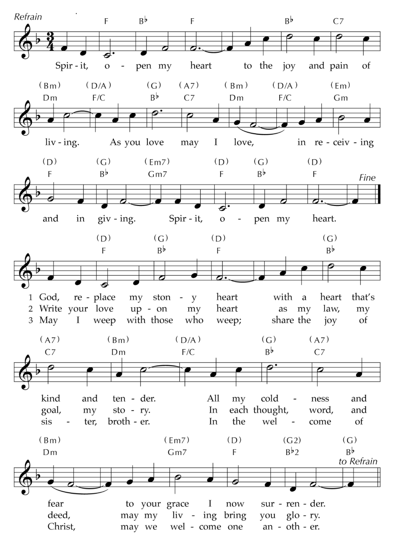
The pace and diversity of modern life often hinder us from remaining vulnerable to our emotions and to the humanness of other people. This prayerful text to be open to such joys and pains draws on Ezekiel 11:19 and 36:26 in stanza one and echoes Jeremiah 31:33 in stanza two.